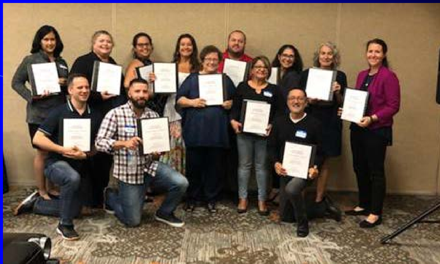
Interpreting for Prenatal Genetics Training of Trainers at the Annual Educational Symposium of the Texas Association of Healthcare Interpreters and Translators September 2018